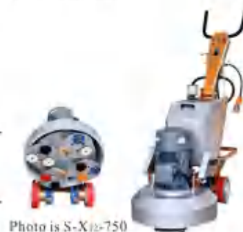
Photo is S-X12-750