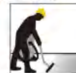
Rinsing and cleaning for each polishing step