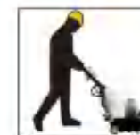
50# (50#300# grinding)