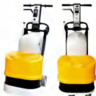
V 6 -380B