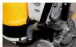
External vacuum port