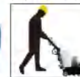
500#(800#) 500# polishing