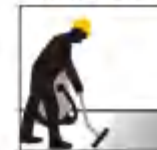
Cleaning after keep moist state at least 2 hours.