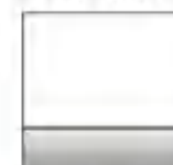
Keep 12 hours/3 hours