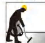
Rinsing and cleaning for each grinding step